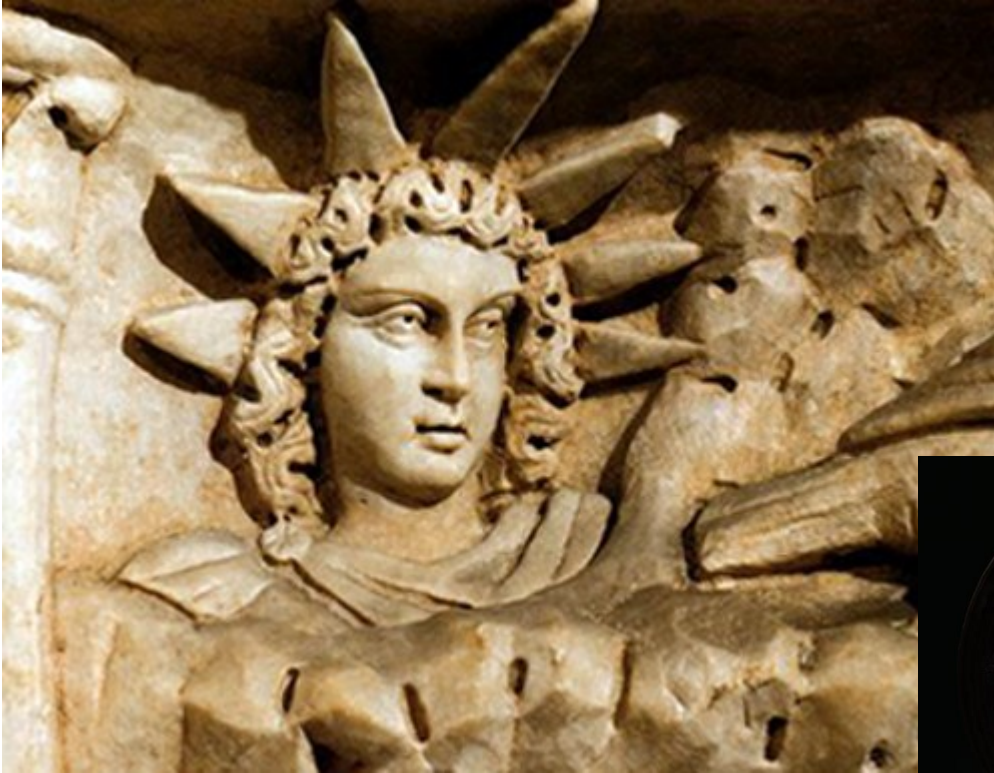
LEFT: MITRA—A Persian Sun Goddess